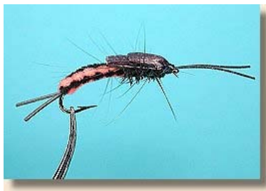
Granny Weave EZ stone