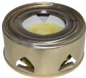
Jerry Rigged Backpackin/Fishin Stove: